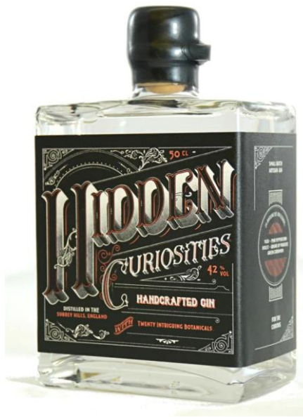
FF180 Hidden Curiosities Gin 500ml