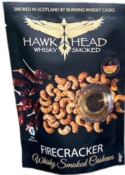
FF9912 Whisky Smoked Firecracker Chilli Cashews 60g