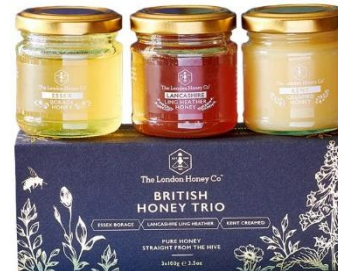
FF298 British Honey Trio Gift Set 3x100g