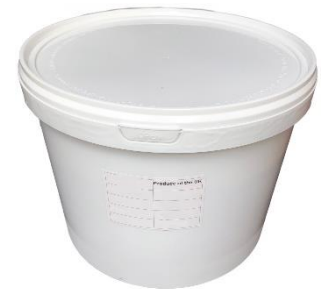
FF287/293 London Honey 5Kg Tub