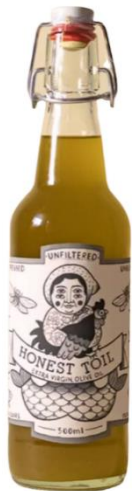
FF3501 & 3506 Extra Virgin Olive Oil 500ml