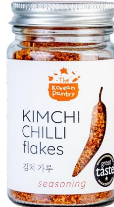
FFK015 Kimchi Chilli Flakes 60g