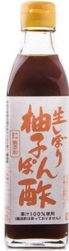
FF2213 Fresh Yuzu Ponzu 300ml