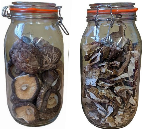
FFM006 Dried Shiitake FFM002 Dried Porcini

Fresh mushrooms prices may vary weekly and subject to availability