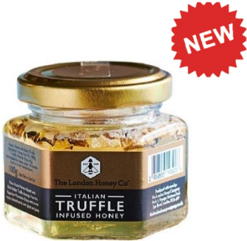
FF300 Truffle Honey 100g