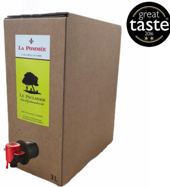
FF113 Premium Apple Balsamic Vinegar 3L