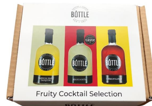
FF2090 Fruity Cocktail Gift Pack 3x100ml