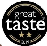
FF150 Great Harvest Maple Syrup 500ml