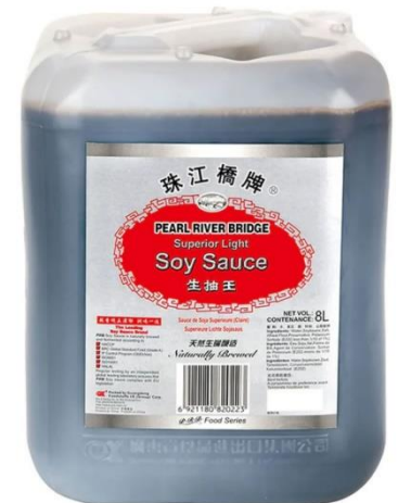
FF2802 Superior Light Soy Sauce 8L