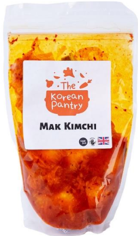
FFK007 Traditional Mak Kimchi 250g