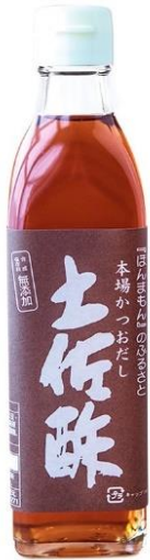
FF2214 Dashi Vinegar 300ml