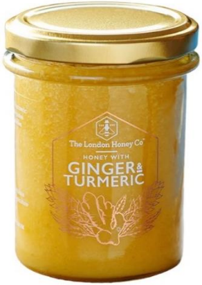
FF292 Ginger & Turmeric Honey 250g