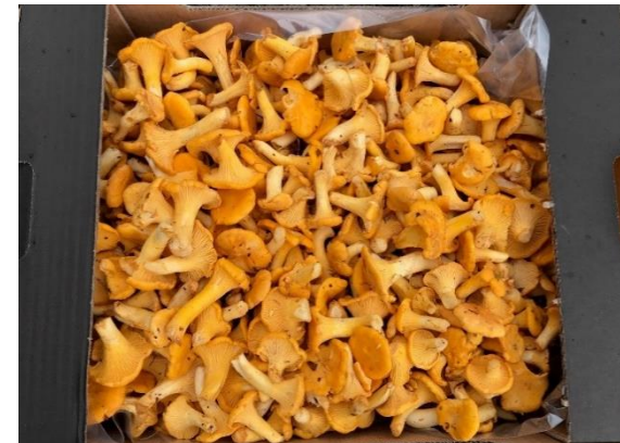
FFM010 Fresh Girolles Tray 2Kg