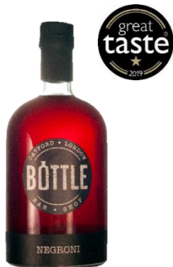
FF2200 Negroni 100ml