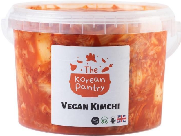
FFK002 Artisan Vegan Kimchi 3Kg