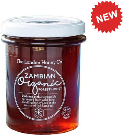
FF301 Organic Zambian Forest Honey 250g