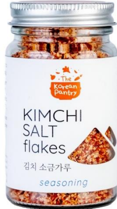
FFK017 Kimchi Salt Flakes 60g