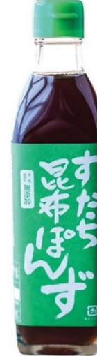
FF2227 Sudachi & Kombu Ponzu 300ml