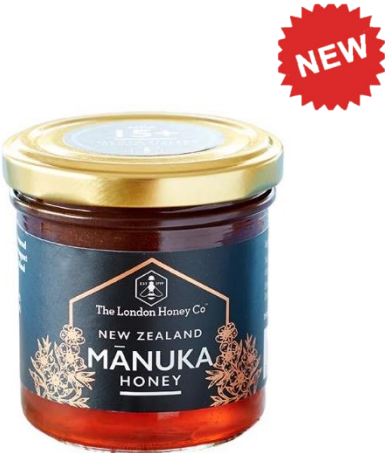
FF302 Manuka Honey 200g