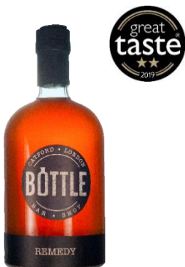
FF2101 Remedy 100ml