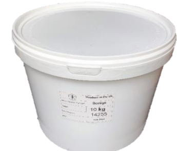
FF281 British Honey 1Kg/10Kg Tub