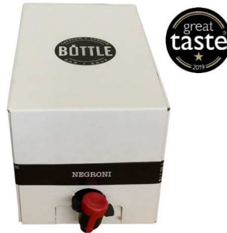
FF2083 Negroni 3L