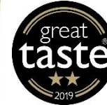
FF176 Great Harvest Maple Syrup 5L (6.9Kg)