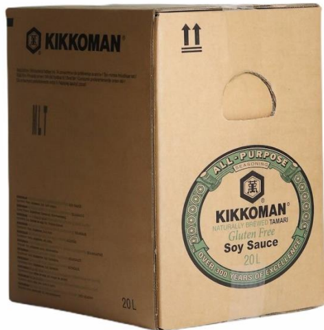
FF2805 Tamari Gluten Free Soy Sauce 20L