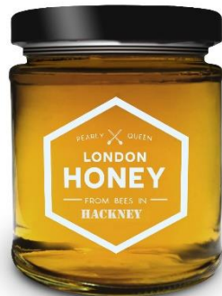
FF2107 Hackney Honey 220g