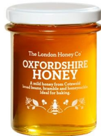
FF272 Oxfordshire Honey 250g