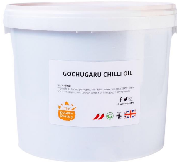
FFK009 Korean Gochugaru Chilli Oil 3L