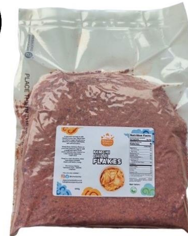
FFK010 Kimchi Seasoning Flakes 500g