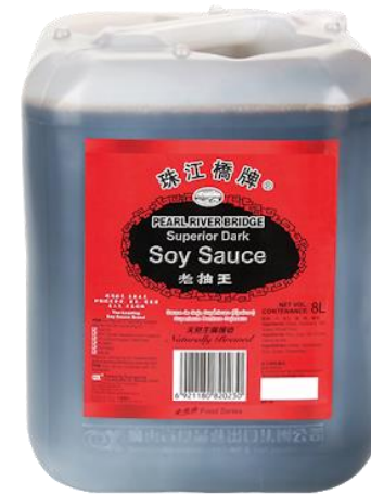
FF2804 Superior Dark Soy Sauce 8L