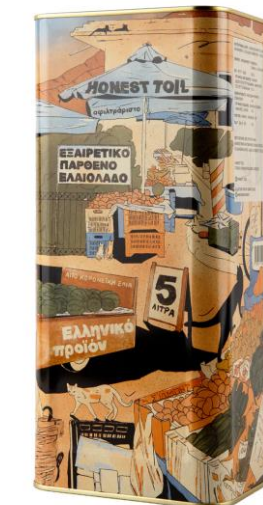
FF3502 Extra Virgin Olive Oil 5L