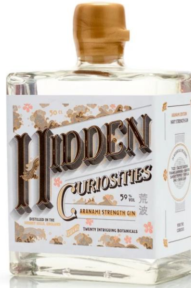
FF183 Aranami Navy Strength Gin 500ml