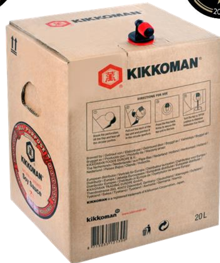
FF2806 Traditional Classic Soy Sauce 20L