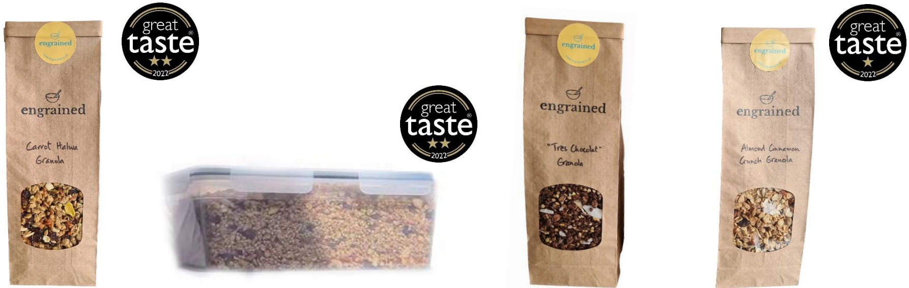
FF3022 Carrot Halwa Granola 300g Bag