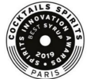
FF155 Organic Yellow Birch 50ml