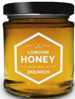
FF2101 Dulwich Honey 220g