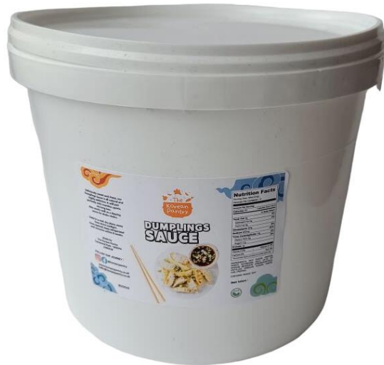
FFK011 Korean Dumplings Sauce 3L