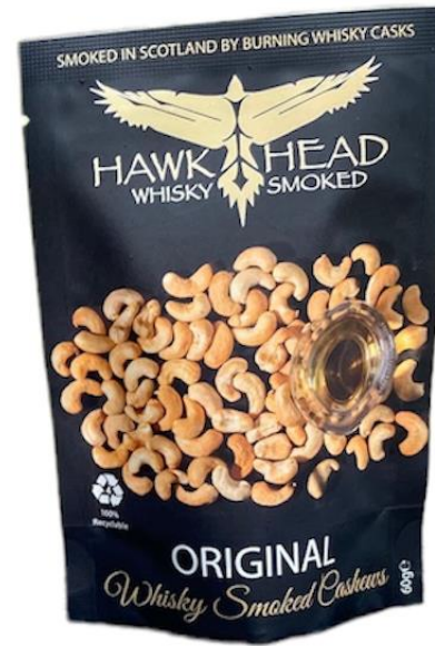
FF9911 Whisky Smoked Cashews 60g