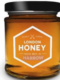
FF2106 Harrow Honey 220g