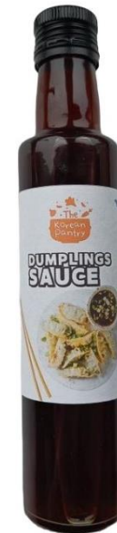
FFK012 Korean Dumpling Sauce 250ml