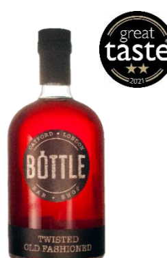
FF2102 Twisted Old Fashioned 100ml