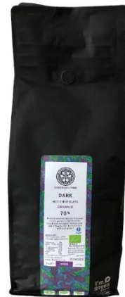
FF2730 Organic Vegan Chocolate Dark 70% Flakes 1Kg