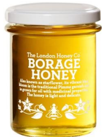
FF270 Borage Honey 250g