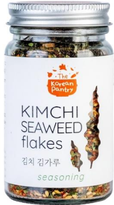
FFK016 Kimchi Seaweed Flakes 40g